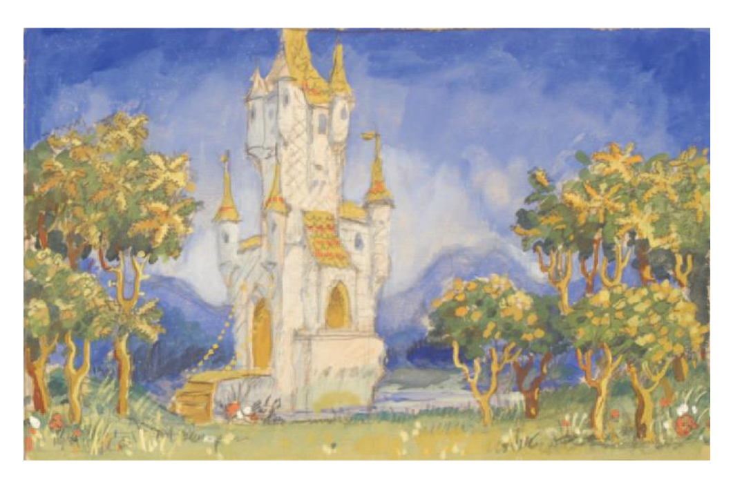
The Wooden Prince (Scenography by Gusztáv Oláh)