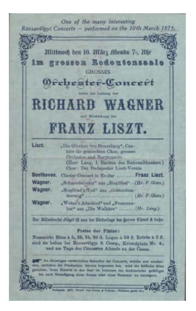
The poster for Wagner and Liszt's mutual concert in the Pesti Vigadó, 1875