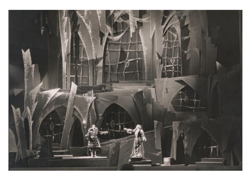
Bluebeard's Castle, stage scenery