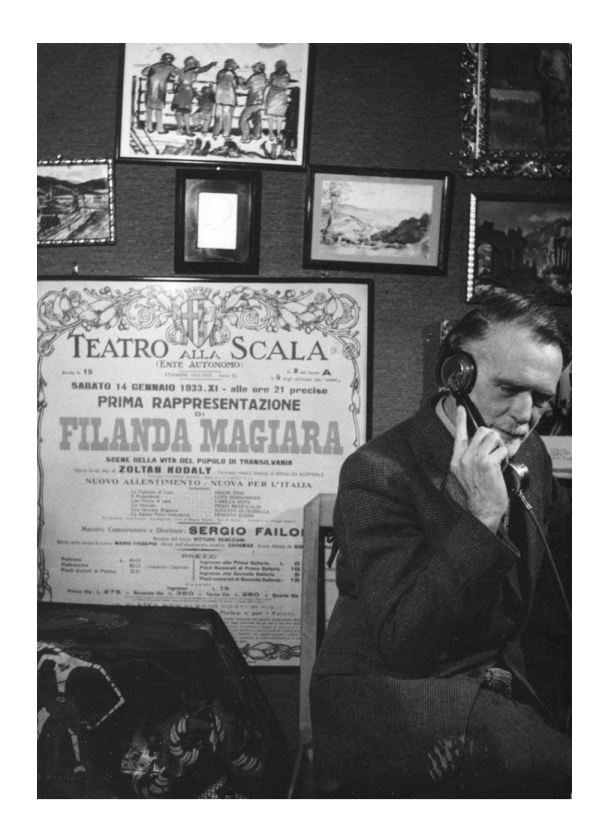
Zoltán Kodály and the poster of Sz\acute{e}kely fon\acute{o} (The Spinning Room) in Milan